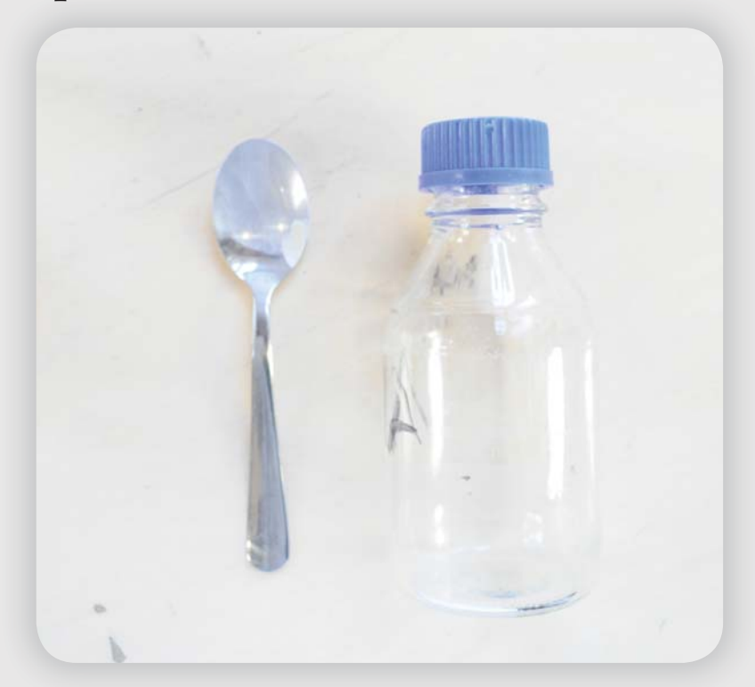
Use a 1L bottle to autoclave your cultivation medium