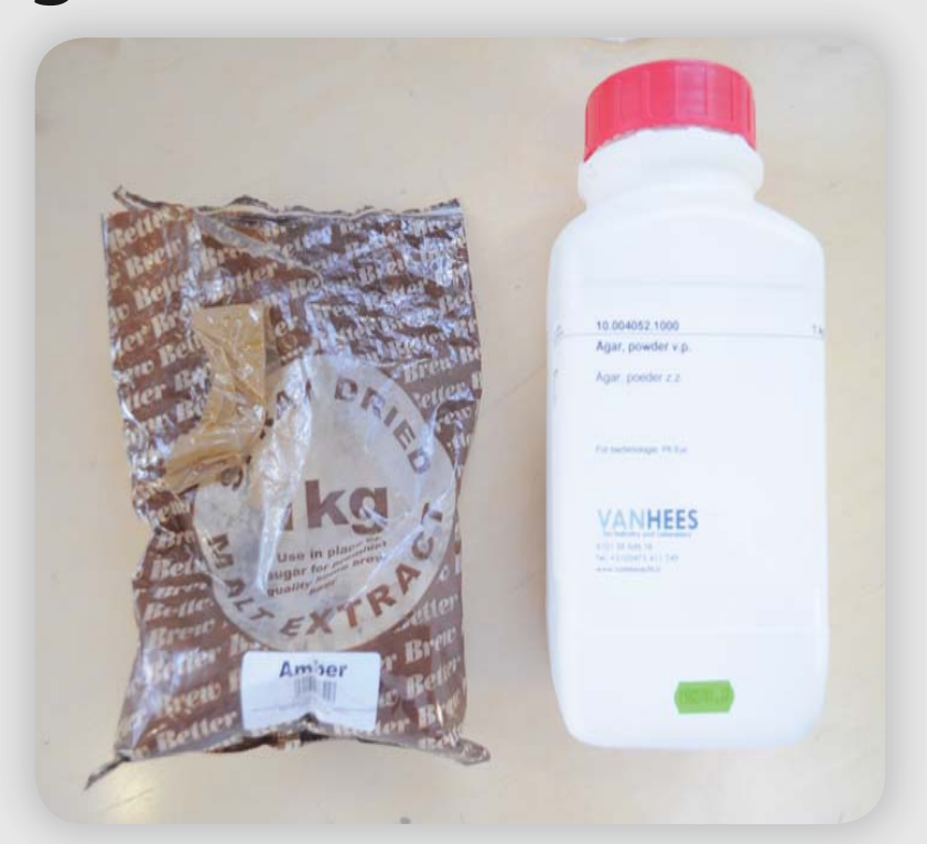
Prepare the ingredients needed for your cultivation medium