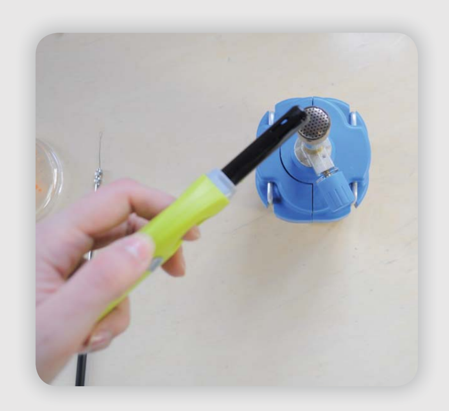
Sterilize your working space by applying alcoohol and firing the gas burner