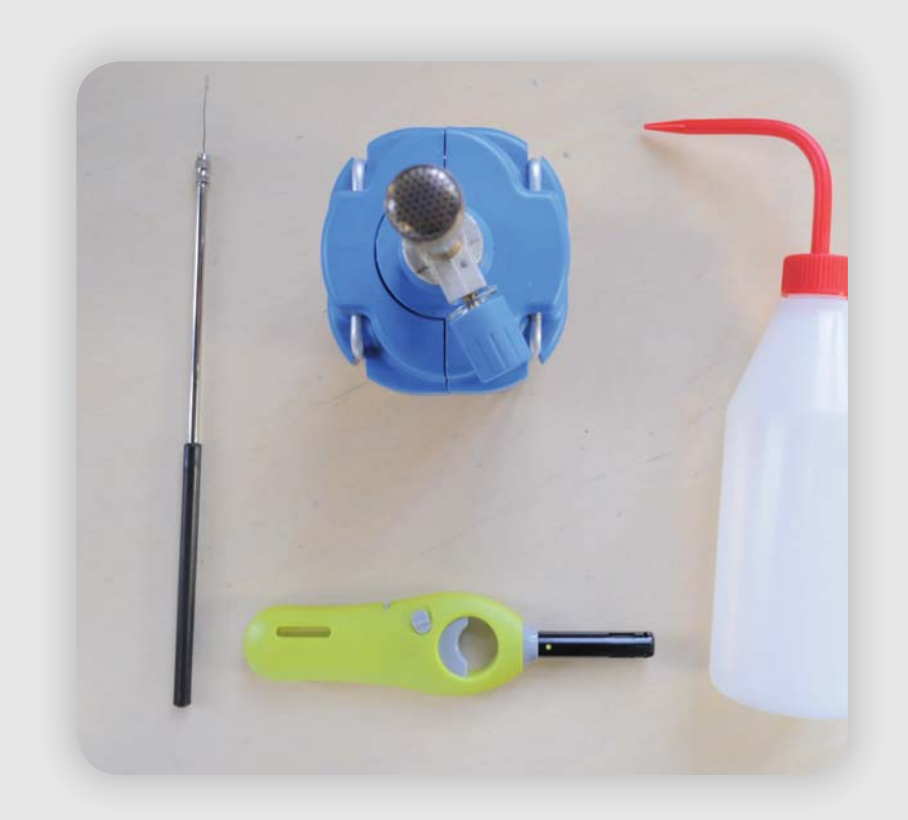
Gather your tools